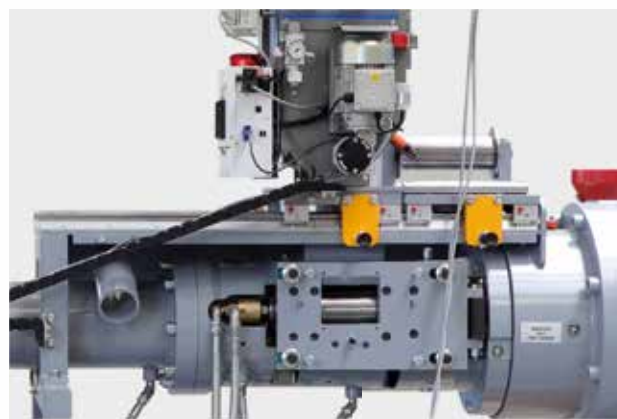
Detail of the hopper sliding system and the strip feed roller