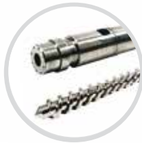
Screws and barrels