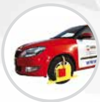
Wheel clamps for cars and trucks