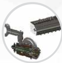
Design and production of tools for extrusion (heads, nozzles etc.)