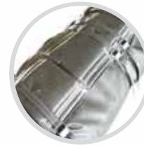
Thermal insulation covers